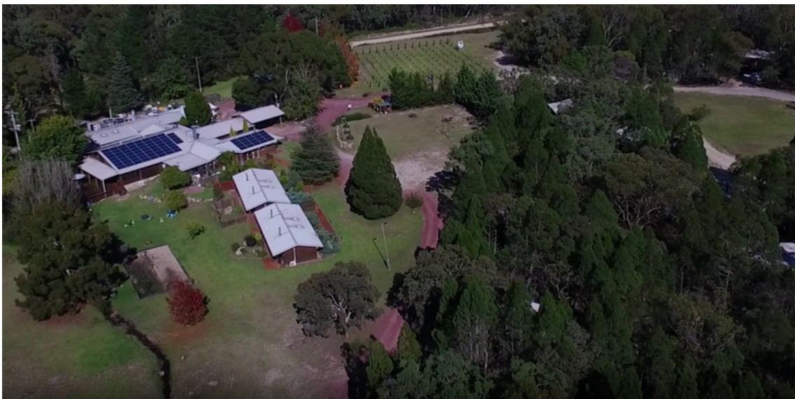
PICTURED: A BIRDS EYE VIEW OF GRANITE BELT RETREAT & BREWERY

Continue reading to discover what we can offer, and please let us know if you have any questions.