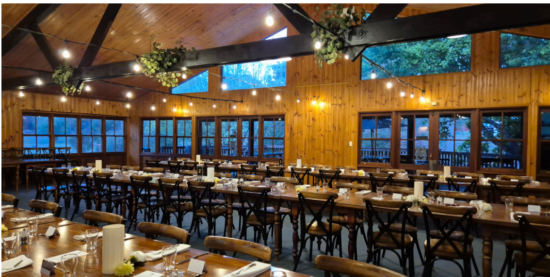
PICTURED: HOMESTEAD RESTAURANT

Featuring festoon lighting and a cosy country charm, our Homestead Restaurant is perfect for accommodating larger functions, with a maximum room capacity of 120.