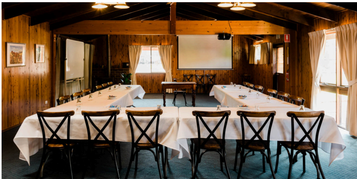
PICTURED: DAVADI ROOM

Our restaurant is open to the general public Friday to Monday. Exclusive use of our Homestead Restaurant is subject to our availability and group numbers; and a minimum spend applies for midweek use.