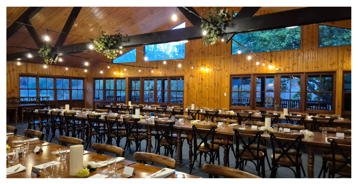
PICTURED: HOMESTEAD RESTAURANT

Featuring festoon lighting and a cosy country charm, our Homestead Restaurant is perfect for accommodating larger functions, with a maximum room capacity of 120.