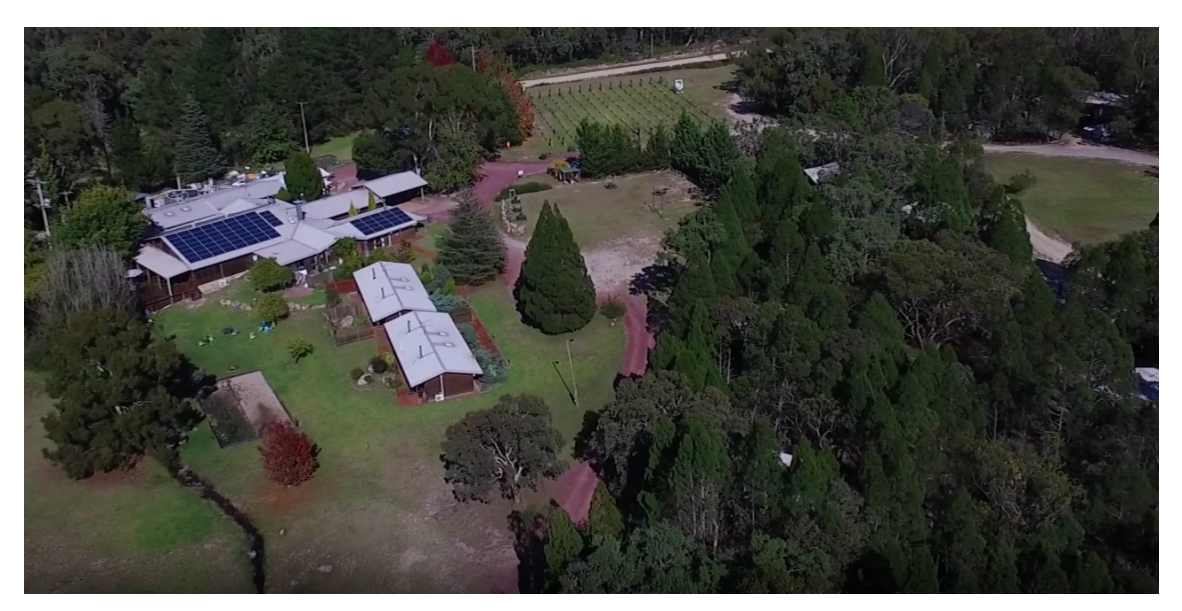
PICTURED: A BIRDS EYE VIEW OF GRANITE BELT RETREAT & BREWERY

Continue reading to discover what we can offer, and please let us know if you have any questions.