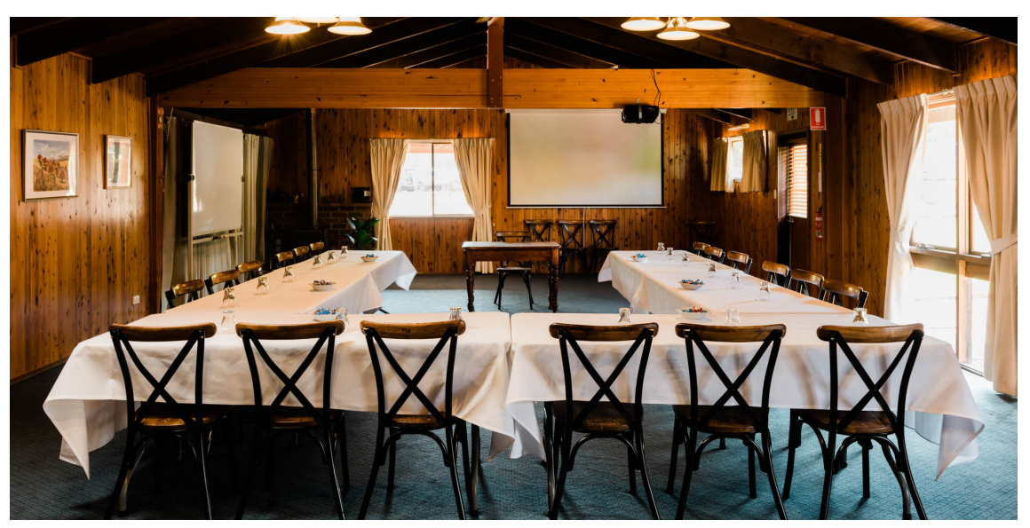
PICTURED: DAVADI ROOM

Our restaurant is open to the general public Friday to Monday. Exclusive use of our Homestead Restaurant is subject to our availability and group numbers; and a minimum spend applies for midweek use.